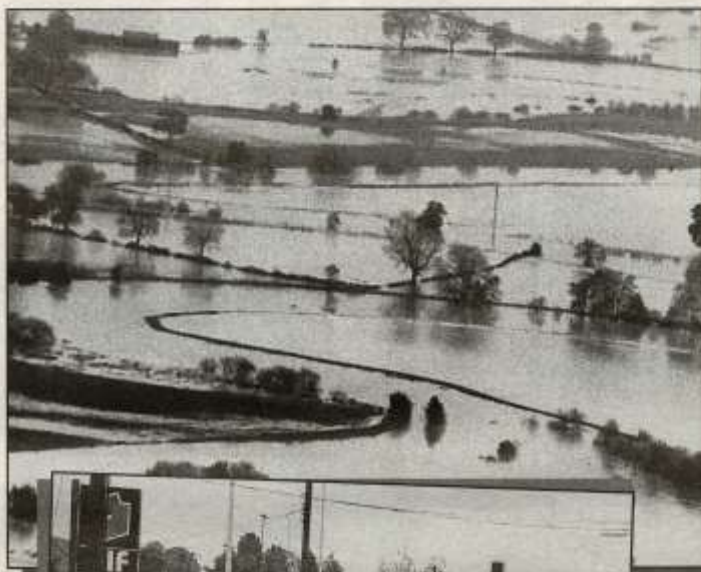
ABOVE: Fields between Bangor-on-Dee and Holt are submerged

'The work is underway now to clear-up after the mess while the region collectively holds its breath that there isn't more rain to come'