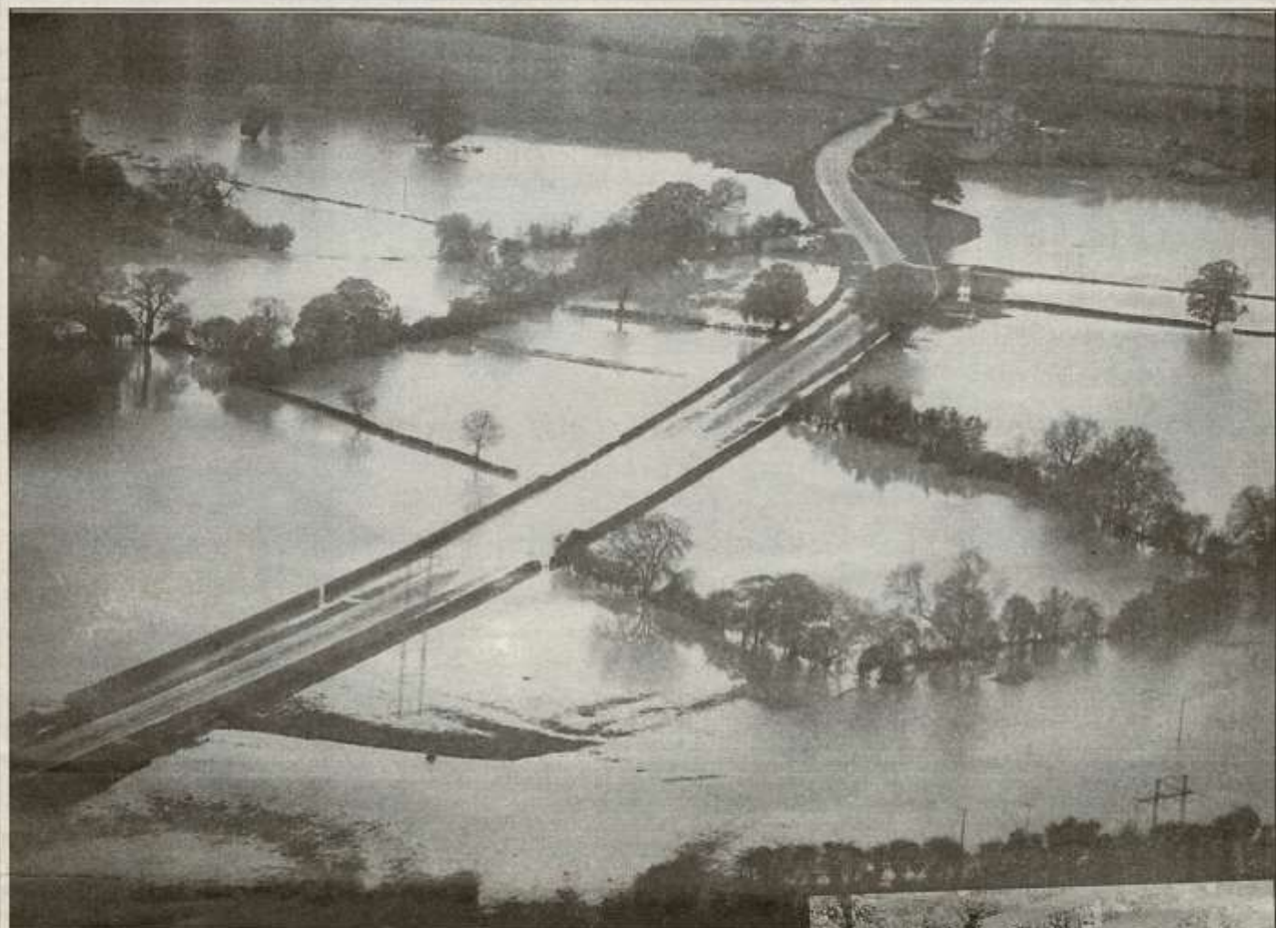
■ ABOVE: The view from the North Wales Police helicopter showing the A525 between Overton and Holybush.