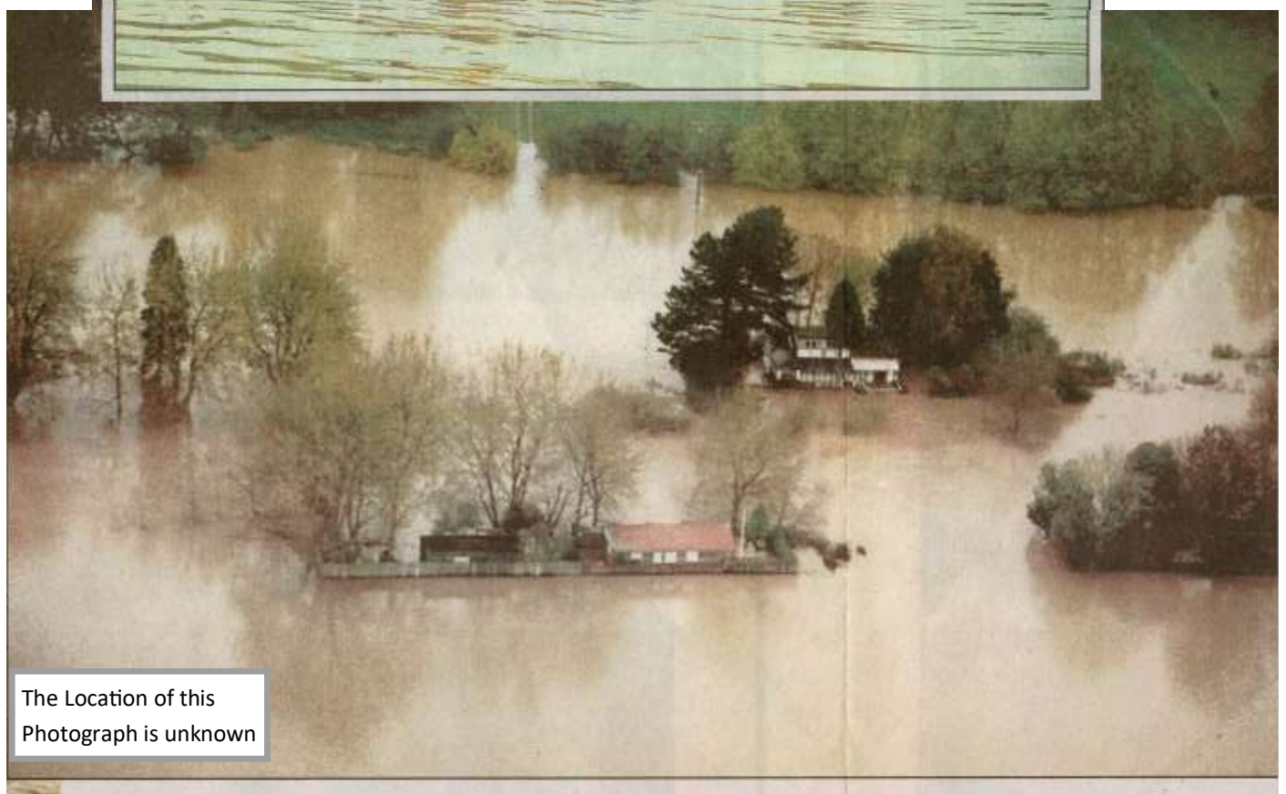
The Location of this Photograph is unknown