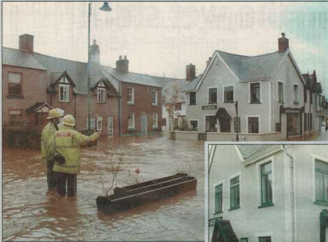
LEFT: Firefighters survey the flooding in Ruthin's Clwyd Street