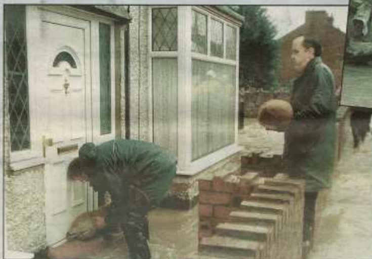
■ Houses in Mold are sandbagged against the flood waters near the Bridge Inn while a motorist rues the day he parked his car at the Aldi store in Mold