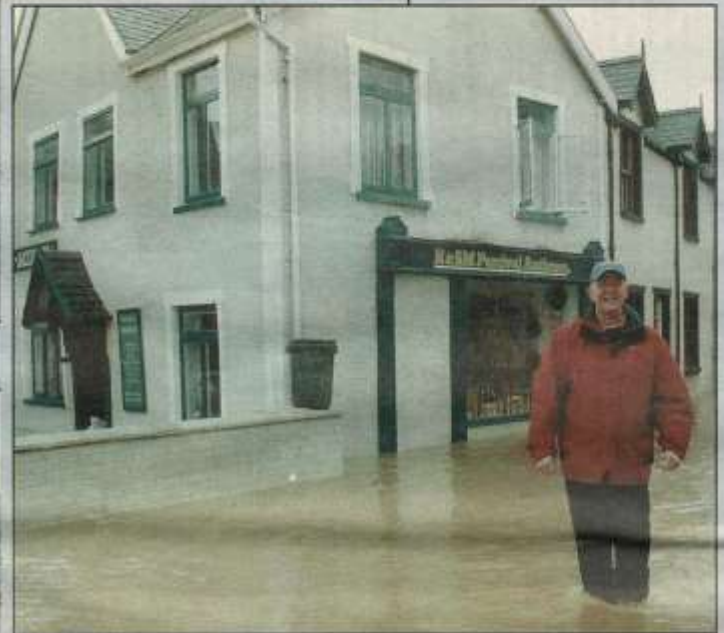
LEFT: Mwrog Street, Ruthin BOTTOM LEFT: Ruthin residents battle against the floods in Clwyd Street. BOTTOM RIGHT: A photographer wades out for his snap of a lifetime in a Ruthin street.