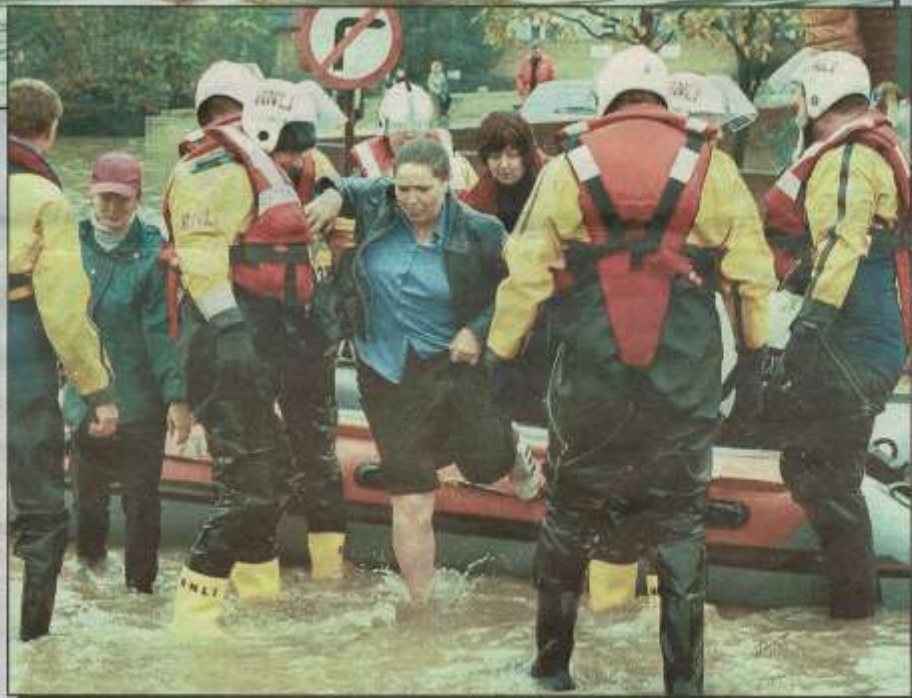
■ Volunteers from the Royal National Lifeboat Institute at work in Mold to ferry youngsters to school and residents from their houses.