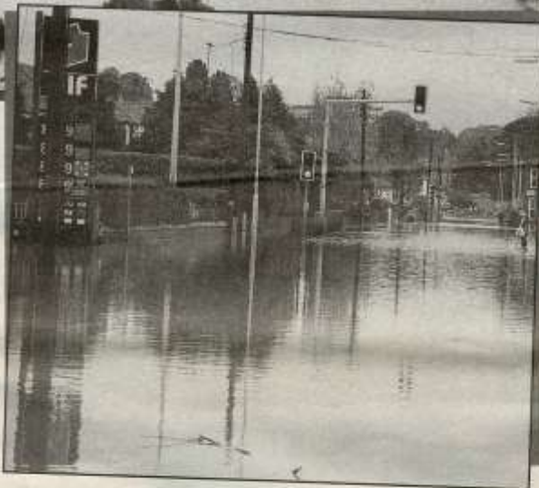
LEFT: The lights say go but there was no traffic on this road in Mold.