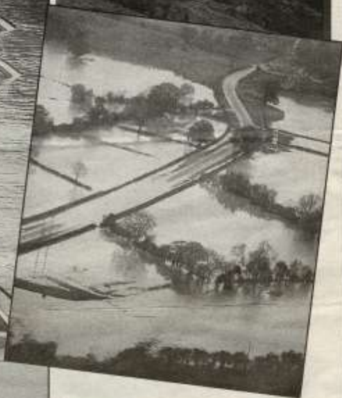
ABOVE: Under water – the A525 between Overton and Hollybush.