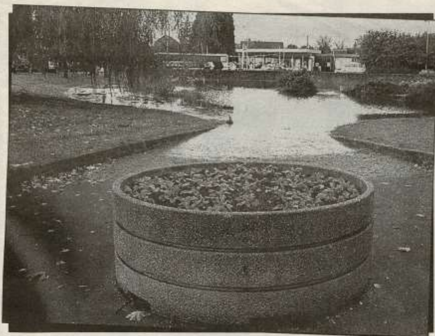
BELOW: The park at the junction of Chester Road and Smithy Lane, Wrexham was turned into a lake after the downpour.